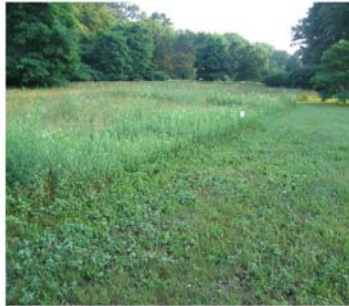
lawn / meadow grass