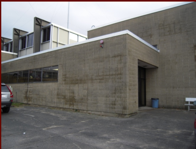
POORLY INSULATED MASONRY WALLS WITH WEAK AIR BARRIER SYSTEM