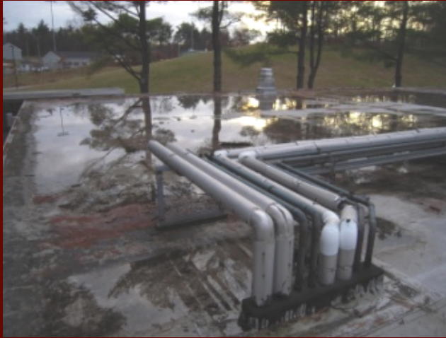
PONDING ON ROOF / EXPOSED PIPING