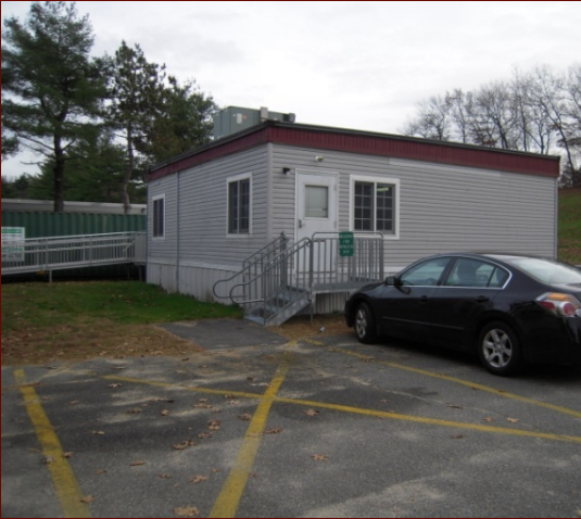
STAND ALONE CLASSROOM TRAILER