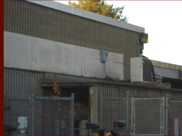
DELAMINATING PLYWOOD PANELS