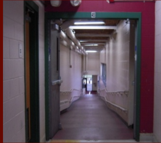
NONCOMPLIANT, INACCESSIBLE AREAS