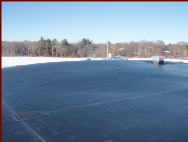
OPEN SEAMS IN ROOFING