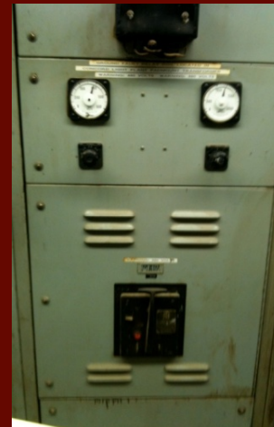
OUTDATED AND DETERIORATING ELECTRICAL PANELS