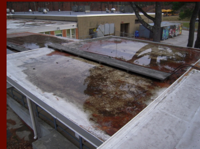
PONDING ON ROOF / DETERIORATING WOOD PLANK WALKING PADS