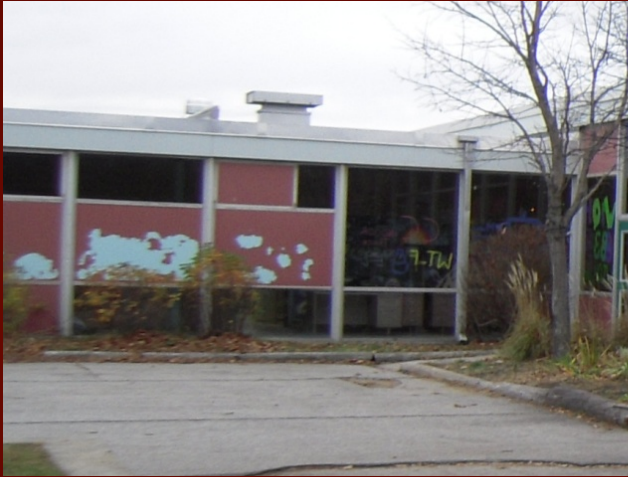
1960's NONINSULATED STOREFRONT SYSTEM WITH PEELING PAINT ON METAL PANELS