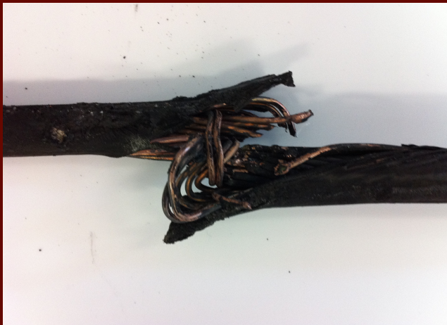
CABLE FROM RECENT ELECTRICAL FAILURE