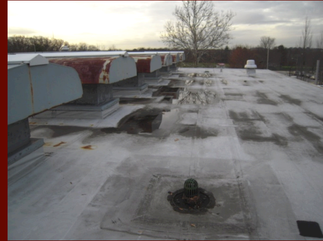
DETERIORATING ROOF TOP UNITS / MINIMAL ROOF DRAINS