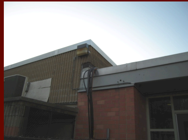
EXPOSED UTILITY LINES